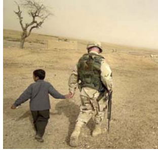
Soldier with a child

In what ever fashion availability may look to you, you can be assured that practicing this character trait builds relationships and good will between